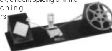
Product No. I-580 Model 1000

The Model 1000 motorized cartridge loader cuts, splices and loads 16mm film from large reels into cartridges. It also loads 16mm and 35mm film onto reels and cartridges. A splicer is mounted for quick, efficient splicing of film or attaching leaders to film.