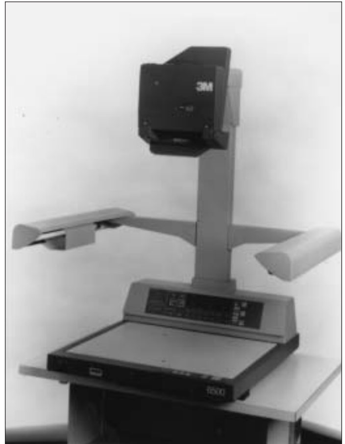
3M 6500 Planetary Camera (Minolta DR16 Camera)

The 3M 6500 Camera not only senses document height for automatic reduction control, but it also